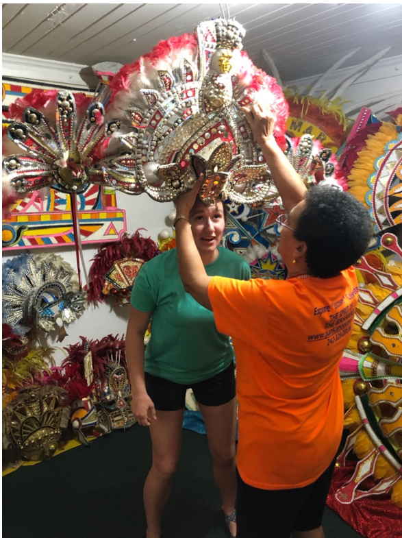
Me trying on a Junkanoo headpiece at the EduCulture (Junkanoo) Museum