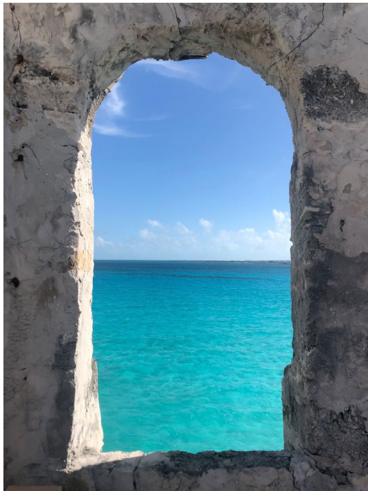
On top of an old Lighthouse on Blue Lagoon