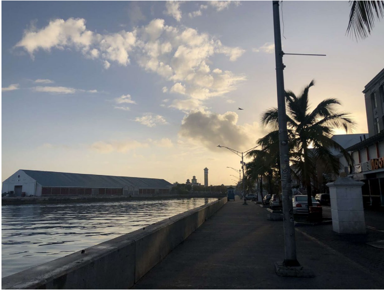
Downtown Nassau in the morning before cruise ships arrived