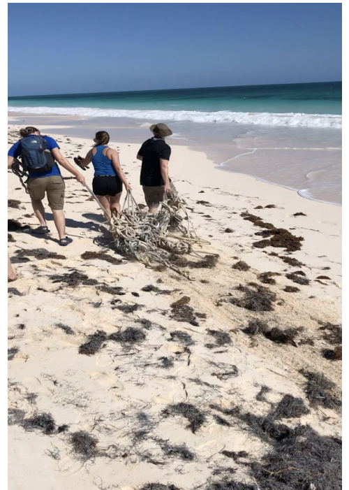
One of my professors, my classmate, and I cleaning up East Beach on San Salvador