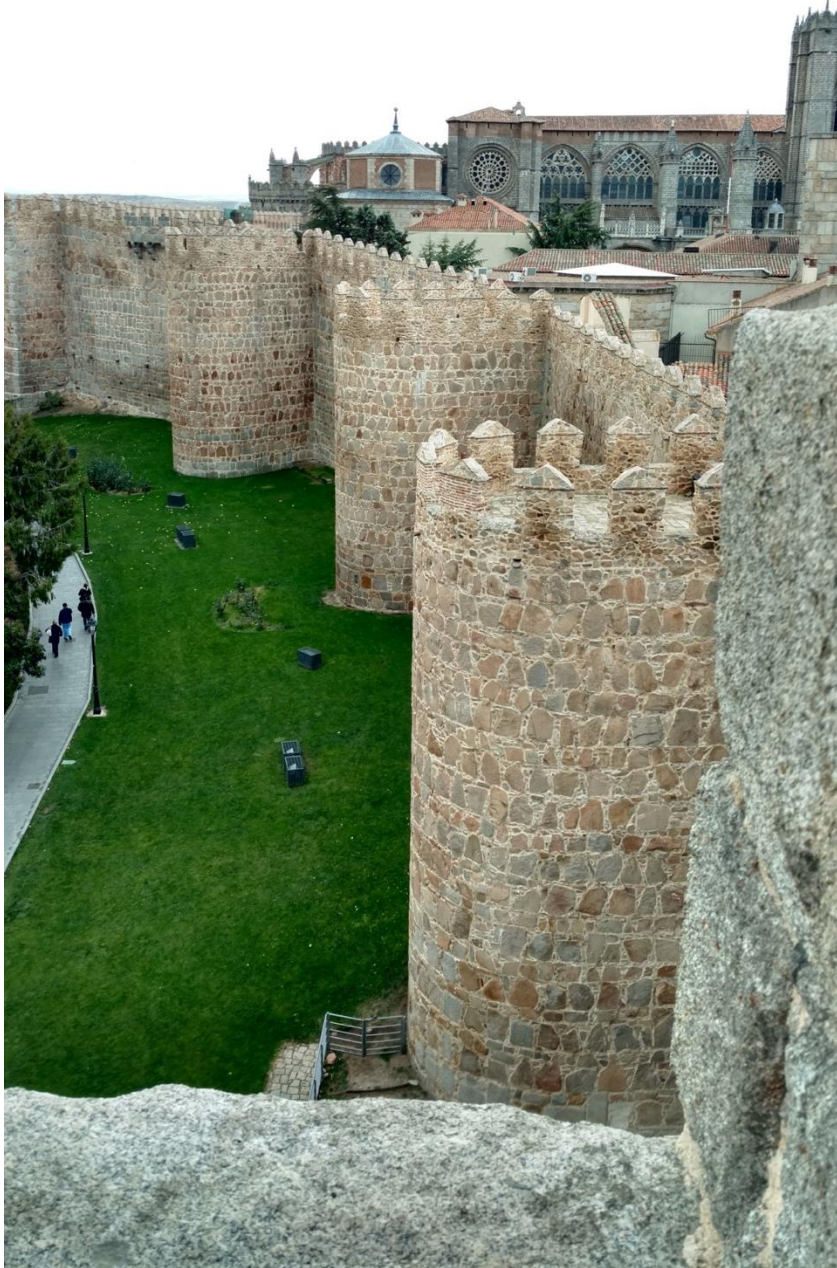
View from the top of the preserved medieval wall in Ávila.