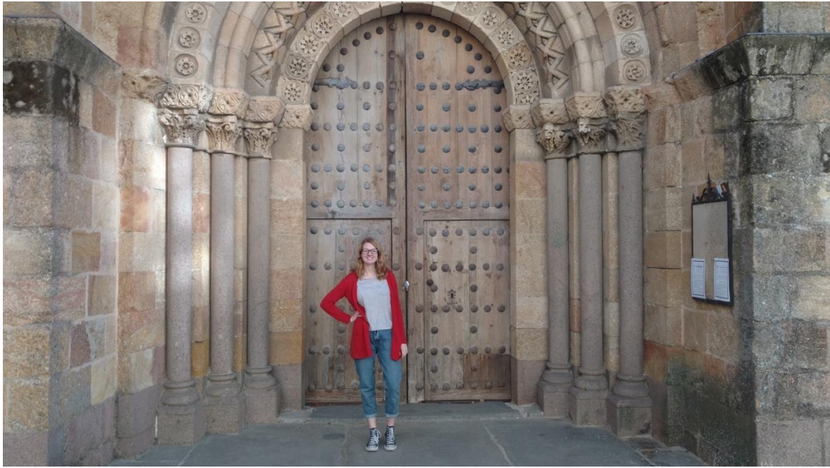
Outside of La Iglesia de San Pedro in Ávila.