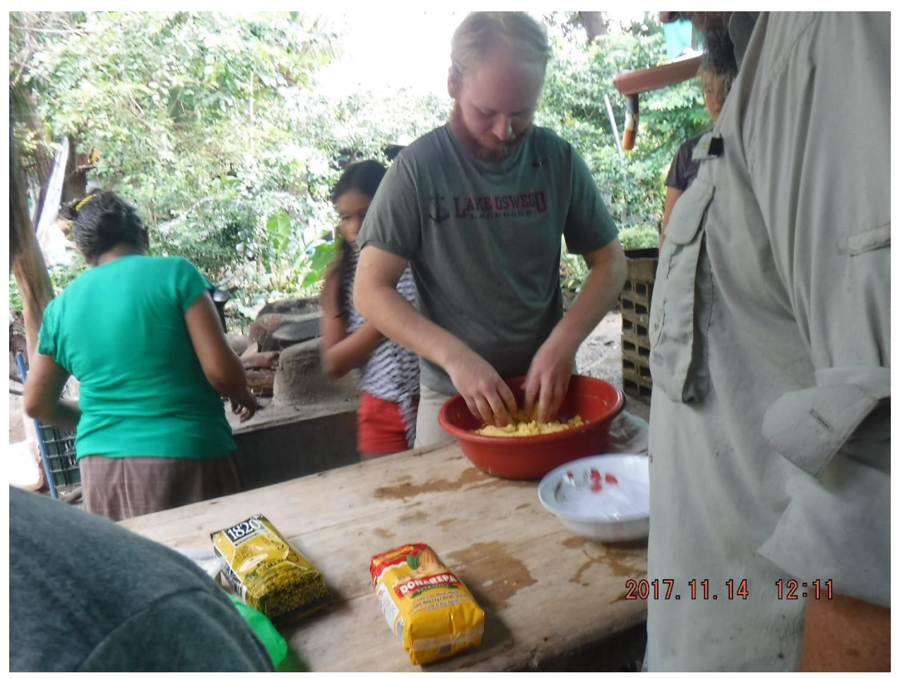
We learned how to make homemade tortillas from one of the abuelas in Ostional.