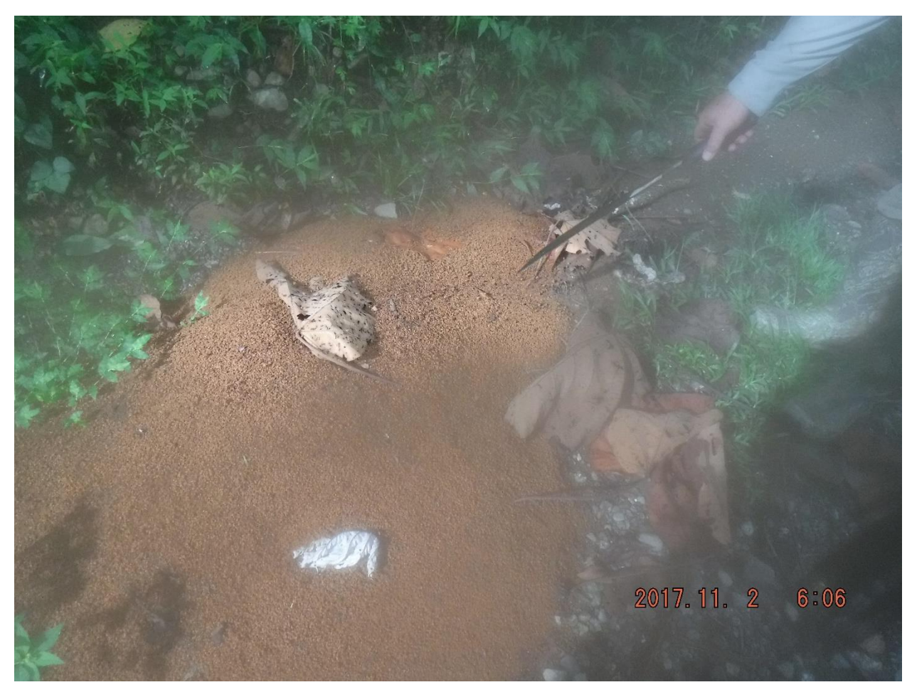
Leafcutter ant "garbage pile" where they take all their waste.