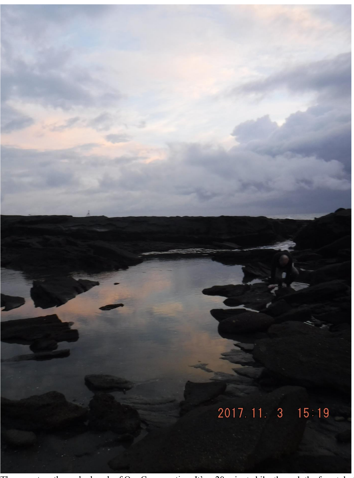
The sunset on the rocky beach of Osa Conservation. It's a 20-minute hike through the forest, but well worth it.