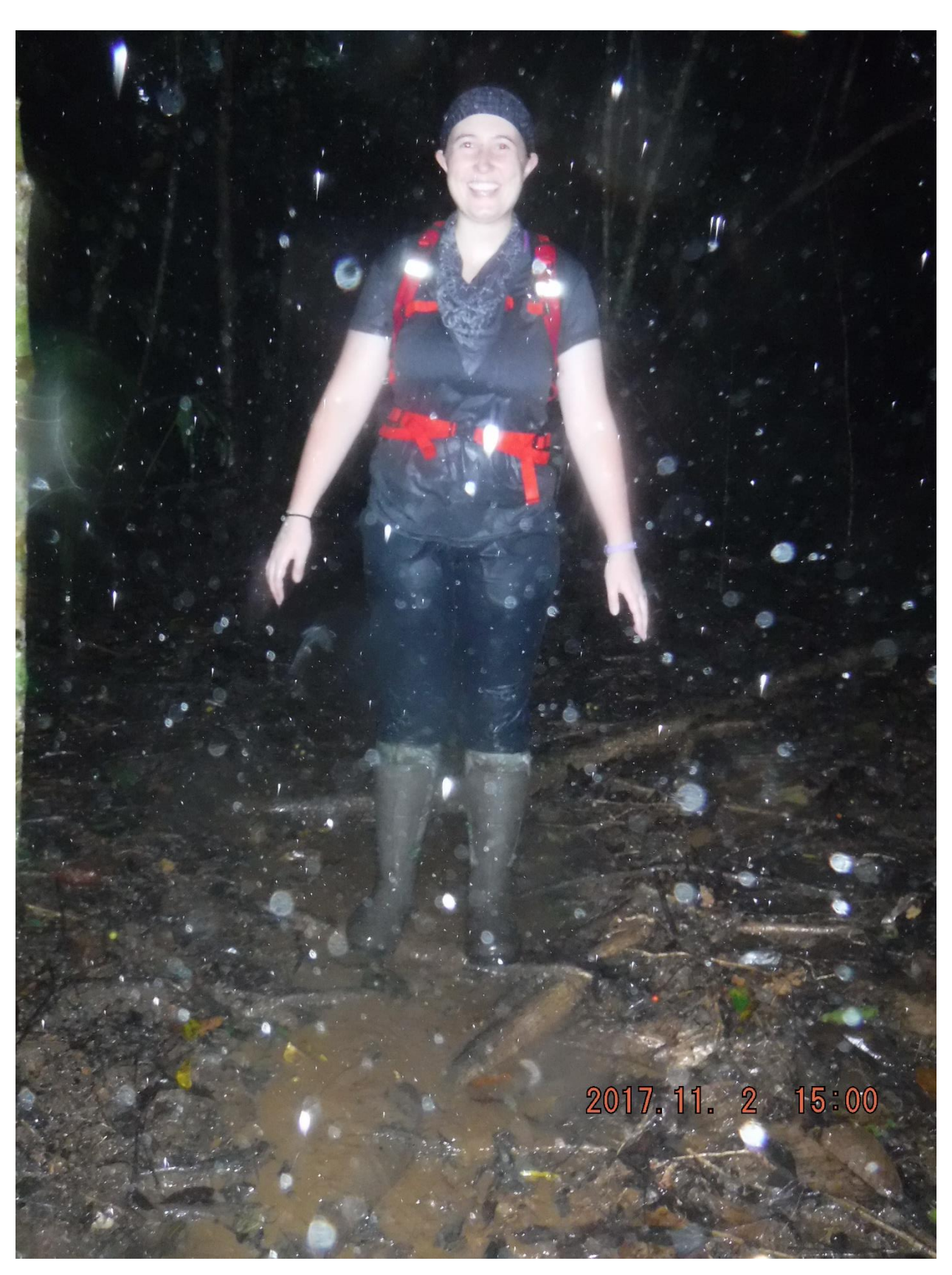
Another student in the rain in the forest. The trails became rivers.