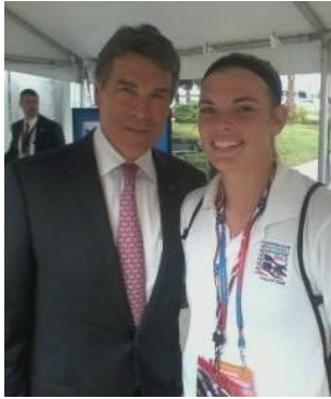
Rick Perry, TX Governor

people (Rick Perry, Piers Morgan, Stephen Baldwin, to name a few) and was able to talk to some delegates and other guests of the Convention. More importantly, I was able to get into the Convention