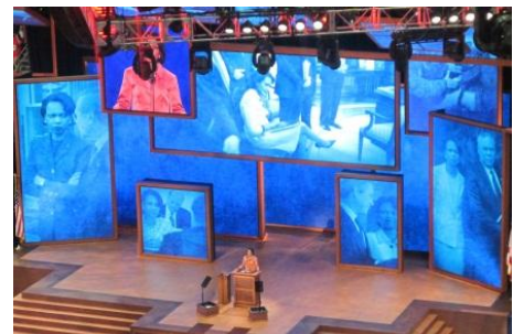
Former Secretary Condoleezza Rice

Convention Area, and I was stationed right outside the Tampa Convention Center, where all the media outlets had work stations (the actual convention was in the forum). Because the first day of the Convention was cancelled due to Tropical Storm Isaac, I only worked Tuesday-Thursday. Tuesday was a long day- from 10:00 AM to 8:30 PM- but the other two days I worked 4:00-8:30 PM shifts. I was able to see some pretty famous