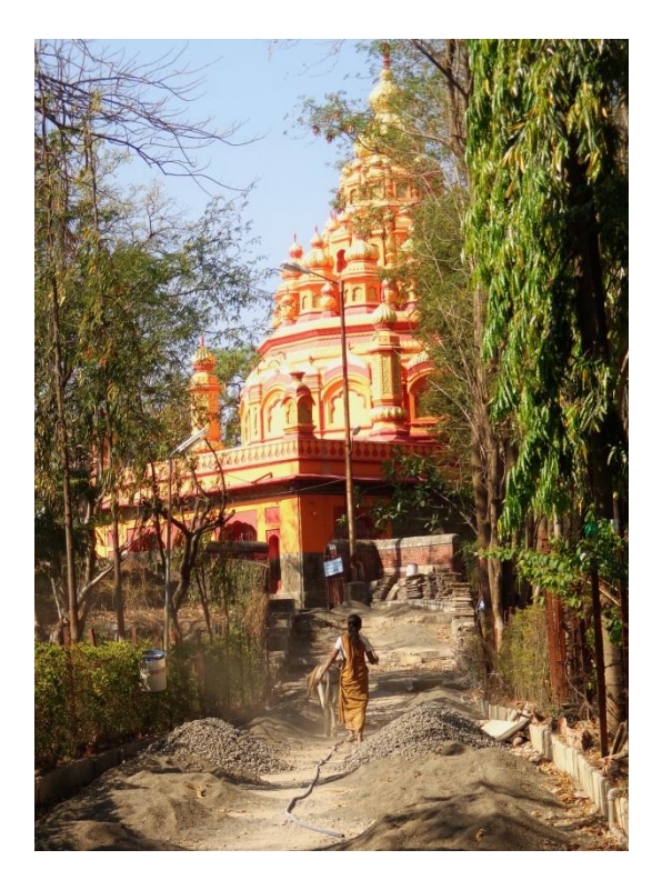
Photo 1 – Pune, India: Here is a women working during one of our visits to a temple.