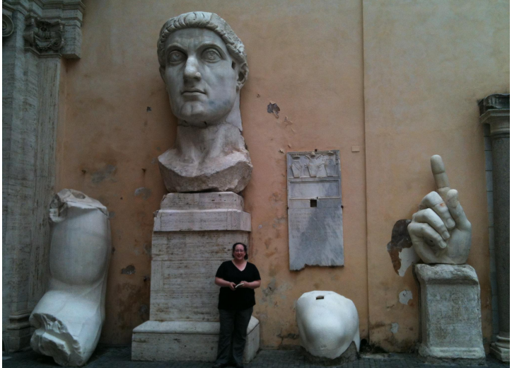
Standing with the remnants of the emperor Constantine