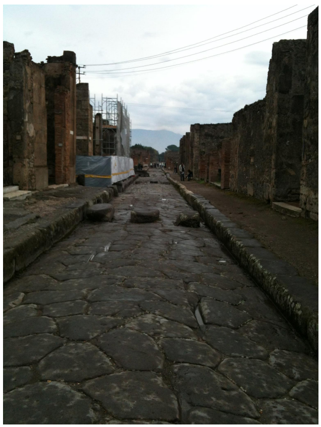
The Streets of Pompeii