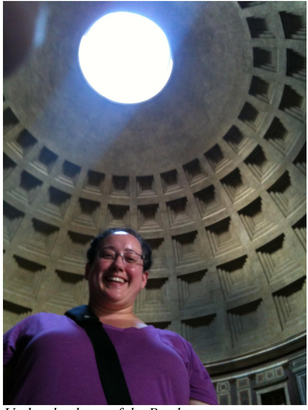
Under the dome of the Parthenon