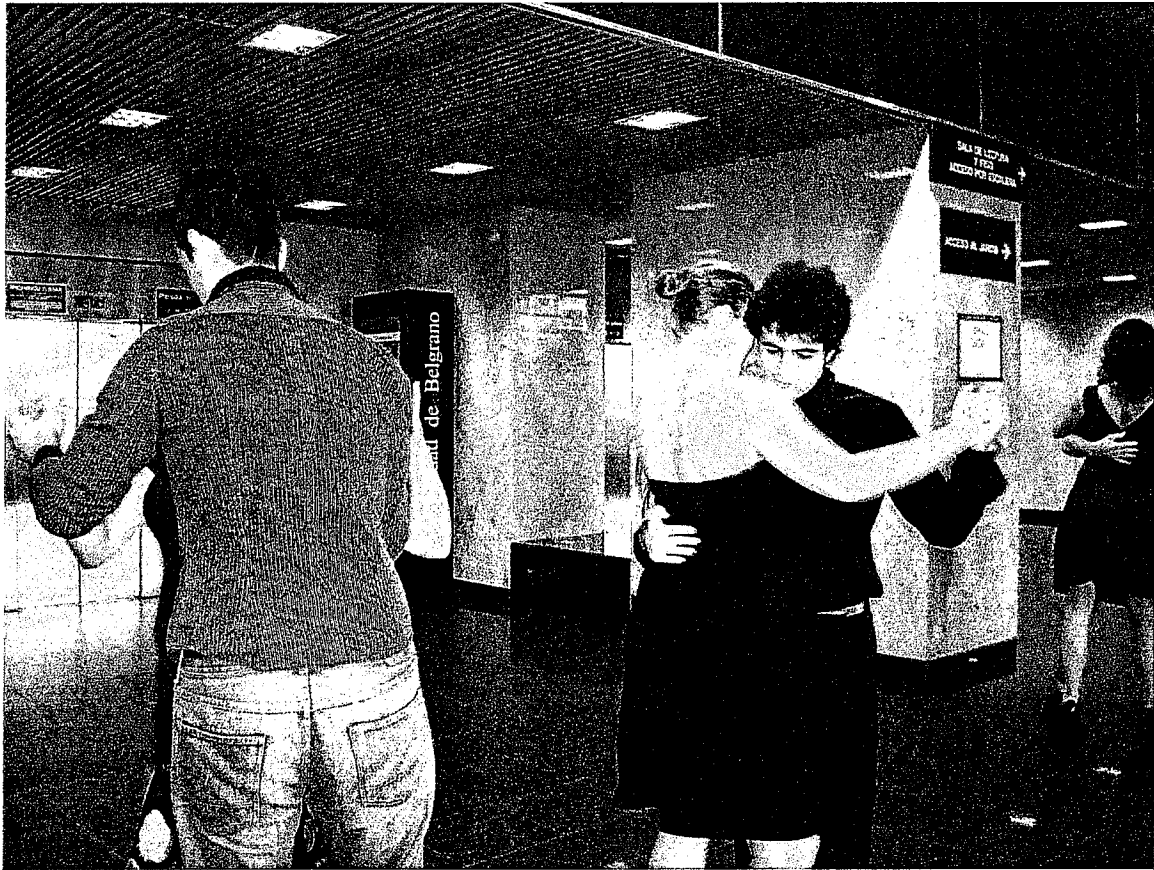
Me dancing during the tango exhibition